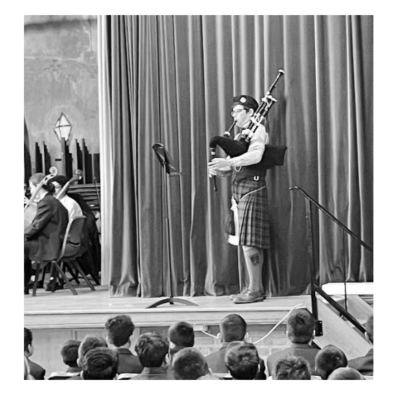
'A Life of Service' Assembly

The school's ensembles and choirs have continued with the same fervour that they left off last year. We still run 20 groups with significant involvement across the school population. At present, roughly one in five boys in the school are involved in extra-curricular music in some way.