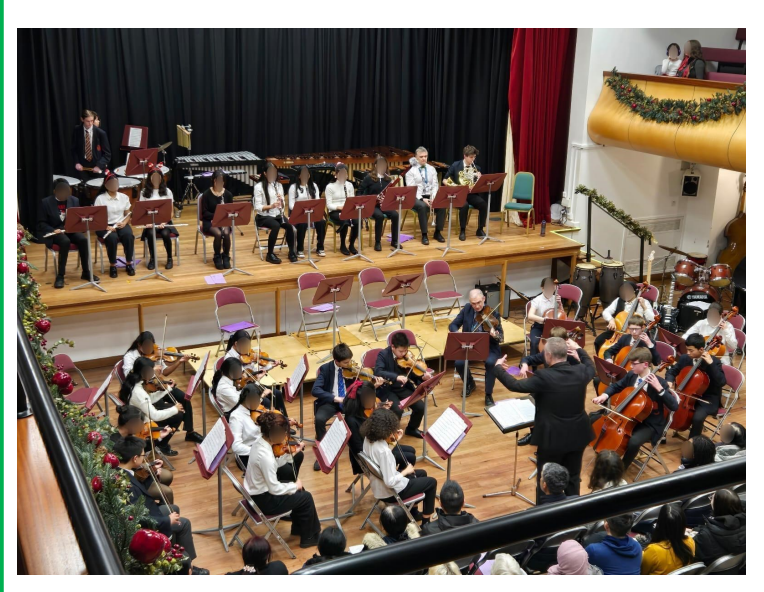
Intermediate Orchestra performing at the Christmas Concert