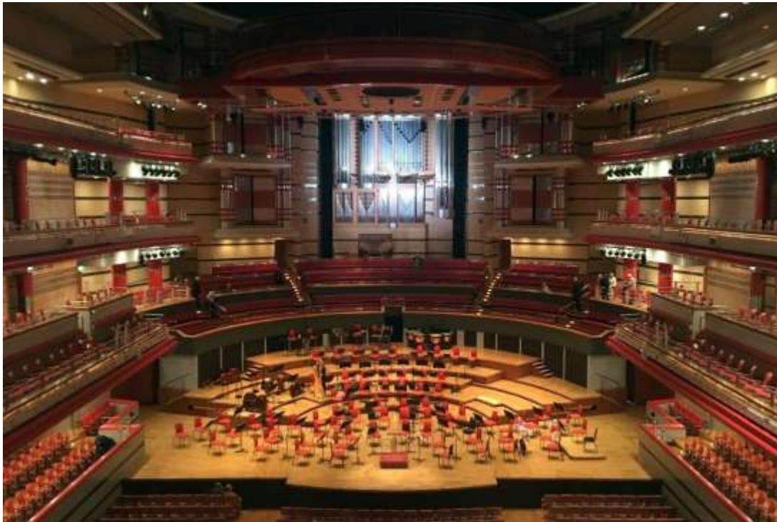
The view of Symphony Hall from where our Year 7 pupils were sitting

This year we were delighted that this event took place. It was a wonderful concert, titled “Natural World”. The music was varied, and used all the colours of the orchestra. Some of the pieces performed were sections from Smetana: Vitava , Stravinsky: The Firebird , Britten: Sea Interludes (Peter Grimes) and Barry: Out of Africa . Many pupils had not visited Symphony Hall before, and loved both the spectacular building and the most exciting live music.