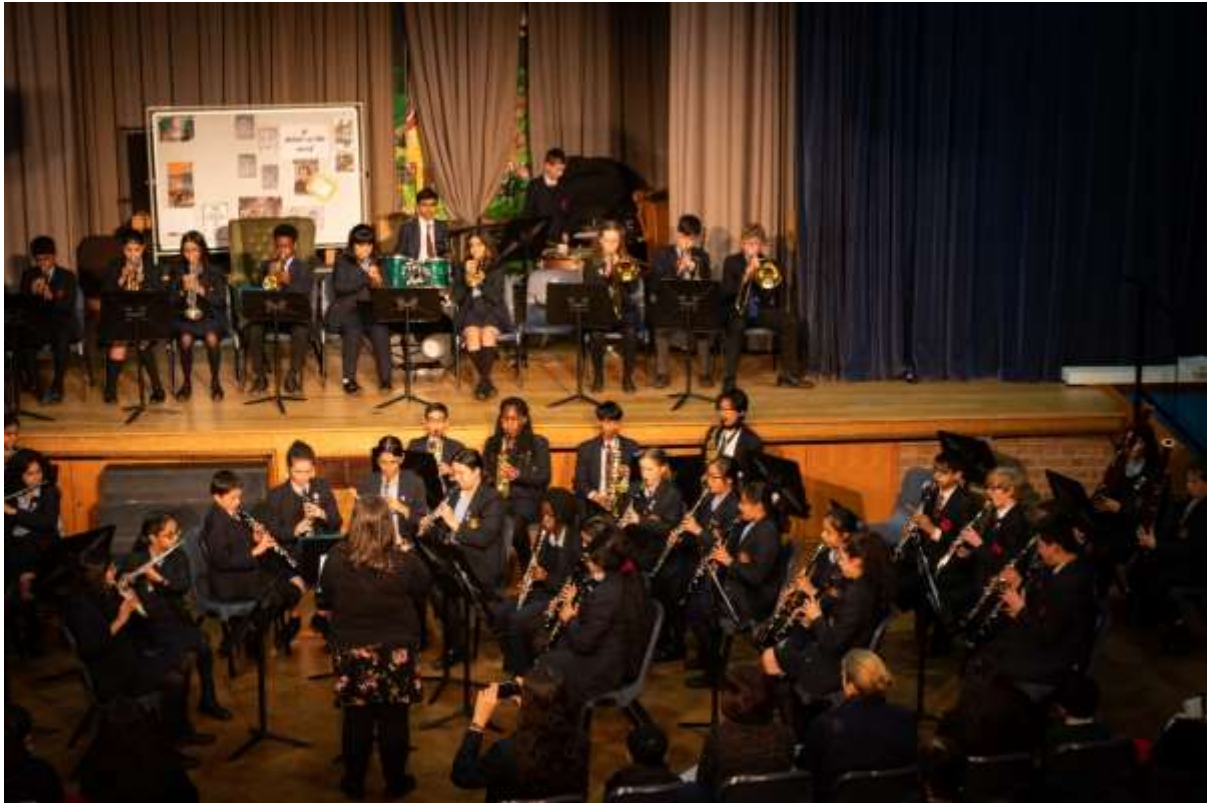
Training Wind Band

The biggest musical undertaking of this term was the decision to put on the wonderful musical Oliver! We knew it would be a lot of work for everyone involved, but also that it would be an exciting opportunity for a large number of pupils.