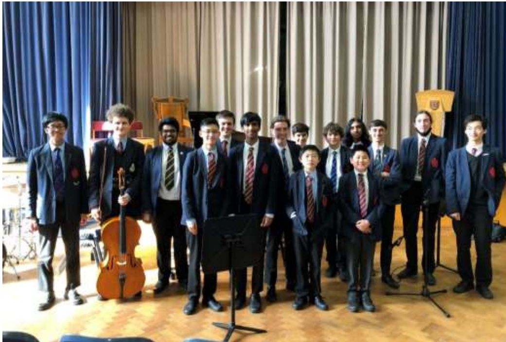
House Music Competition winners 2022: Seymour & Tudor

We now just have one important event left this term: on the penultimate day of term our GCSE pupils record their GCSE performances. It is then time for us all to have a rest.