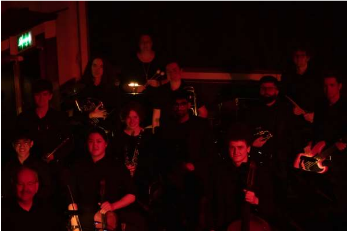
The Oliver! orchestra in our dark corner of the Hall.