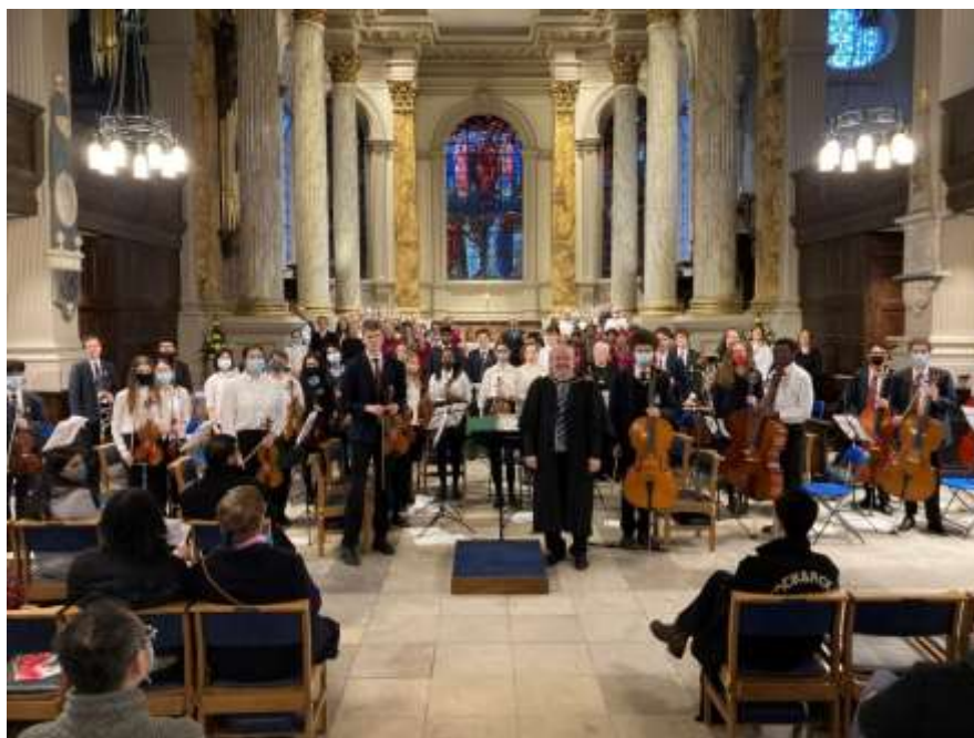
Concert Orchestra in Birmingham Cathedral