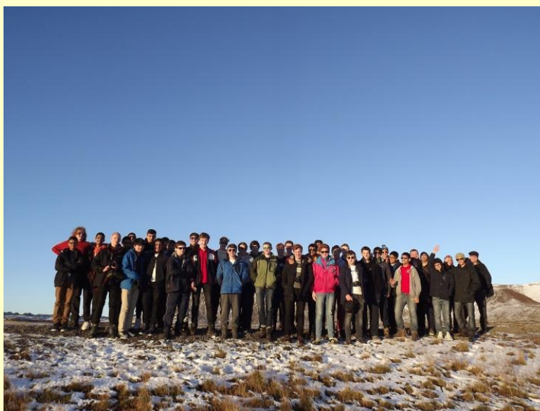
Geography students in Iceland 2015

The structure of the new A-level from is outlined below. Your study will be complemented by at least four days of fieldwork, a range of learning activities, research projects using the department's iPads, and a broad spectrum of enrichment activities, including external talks/lectures run by GA, trips to the Lapworth Museum at UoB and GIS training and competitions. We also ask that our Sixth Form geographers contribute to the of the department by supporting activities and events run for students in lower school.