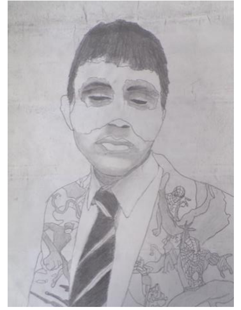
COMIC BOOK PORTRAITS BY YEAR 8